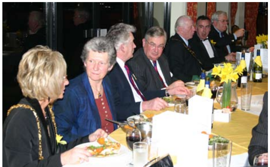
Photo galley of our dinner.

With guests, and fellow service personnel over 60 people sat down to dinner. Many fond memories came back to life for many comrades while talking to our chief guest who many fusiliers had served under.